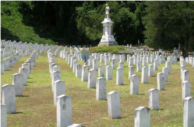
A soldier of stone stands guard over the resting place of Confederate Heroes. Soldiers Rest - Vicksburg, Mississippi

The city of Vicksburg served as a major hospital center in the early years of the Civil War. A section in the Cedar Hill Cemetery was set aside to provide a fitting burial place for Confederate soldiers who died of sickness or wounds. Known as "Soldiers' Rest," the plot in Cedar Hill Cemetery is the final resting place for an estimated 5,000 Confederate soldiers.