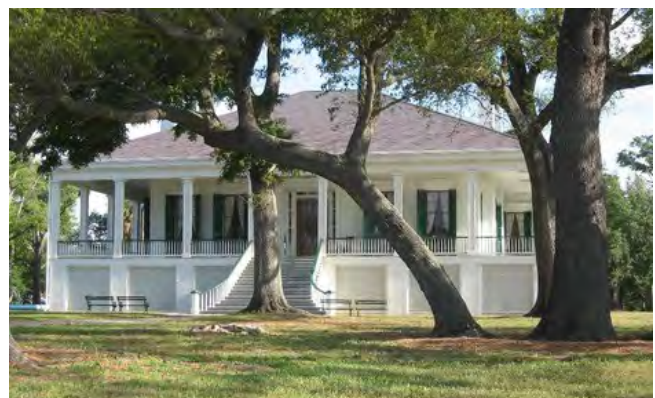
Beauvoir - Post-war home of Jefferson Davis. Biloxi, Mississippi

For as little as $25 annually, you can become a member of the Friends of Beauvoir. Membership includes tour admission and a 10% discount at the Beauvoir gift shop.