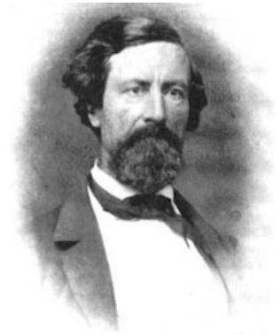
John Clifford Pemberton Lt. General, CSA.

As you know, the attacks on our Heritage continue. Fortunately, we have won several large battles, such as Lee County where the city council voted not to remove the Confederate Monument, and also at Virginia Military Institute, where the governing body declared that they would not change the names of their buildings or remove their Confederate statues and a recent victory also in Lake Charles, Louisiana. These show that we can win battles if we work together for the common goal of defending our Heritage. We still have battles to fight in Congress where we have bills already passed by the House of Representatives, one to remove Confederate statues from Statuary Hall and one to remove all Confederate monuments from all National Parks. These are both radical bills that I personally do not think will pass but we need to continue to contact our U.S. Senators as well as the White House itself